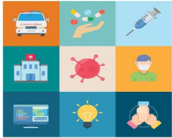
Figure 1. Distribution of reported PLHIV concerns during the COVID-19 crisis