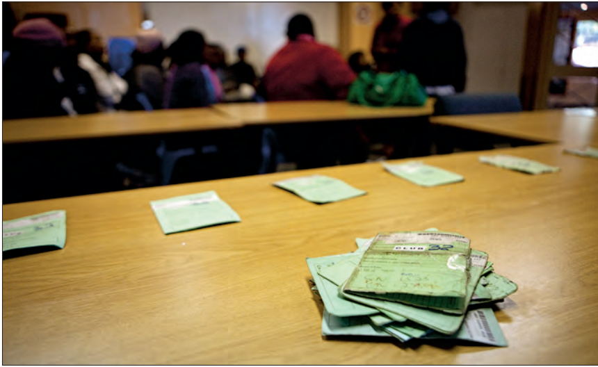
Fig. 2. Patients at an ART adherence club meeting.

plus clinic attendance in the clinic's electronic database by the clinic data capturer. ART clubs are considered part of the ART service at a facility and are managed by a facility-based nurse (called the 'clubs manager') who is responsible for the scheduling of club dates, the smooth running of clubs, clinical governance and club reporting requirements.